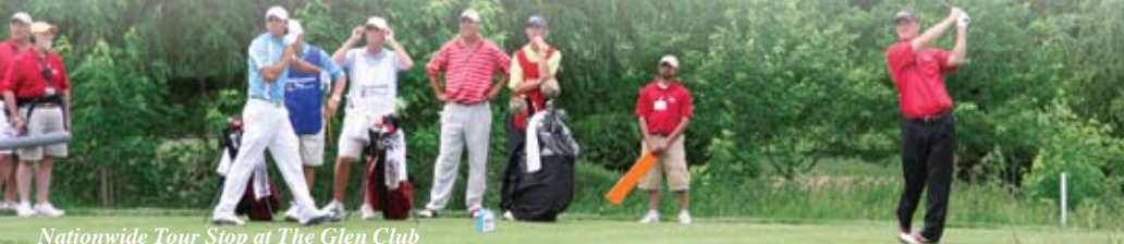
Nationwide Tour Stop at The Glen Club

* For complete PGA schedules visit pga.com , usga.org , lpga.com , and futurestour.com .