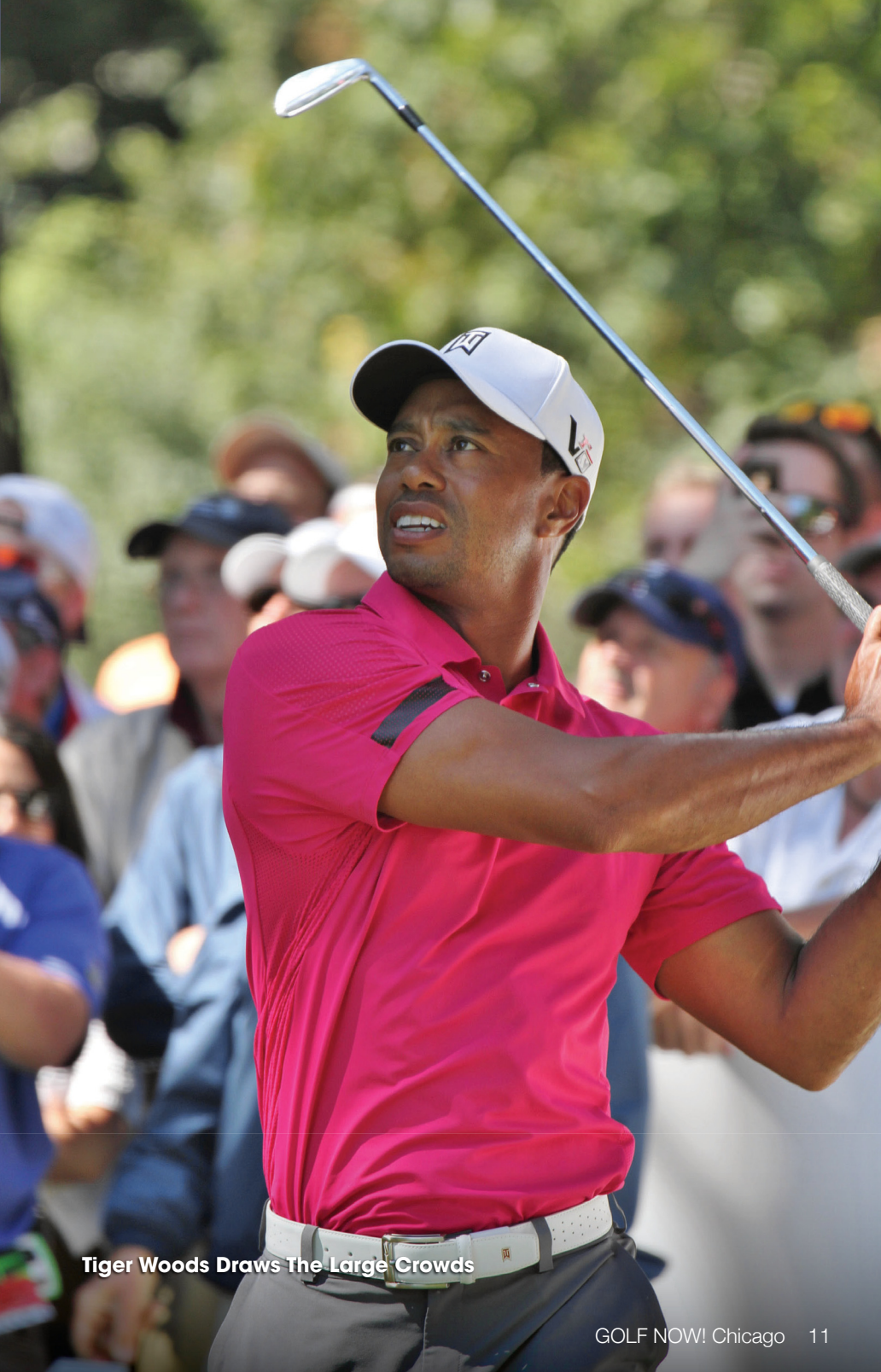
Tiger Woods Draws The Large Crowds