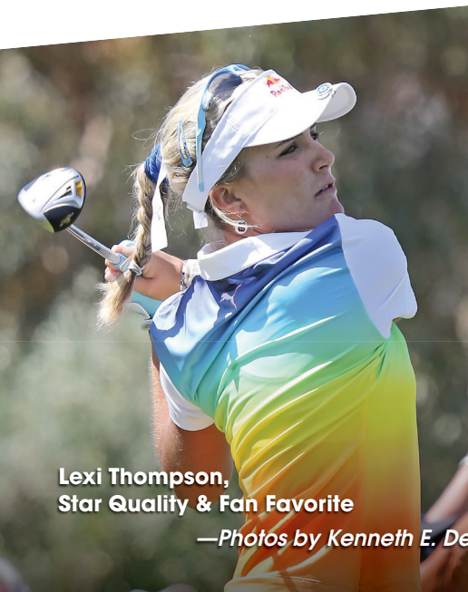
Lexi Thompson, Star Quality & Fan Favorite

The daughter of tennis great Petr Korda, Jessica qualified to play on the LPGA Tour at the age of 18 and played in 15 events in 2011. Her first LPGA Tour victory came at the 2012 Women's Australian Open where she holed a 25 foot birdie putt on the second playoff hole to win a six player playoff. Notching her first top ten at the U.S. Women's Open this past year at Sebonack Golf Club, Korda went on to qualify for the Solheim Cup and join fellow youngster Lexi Thompson.