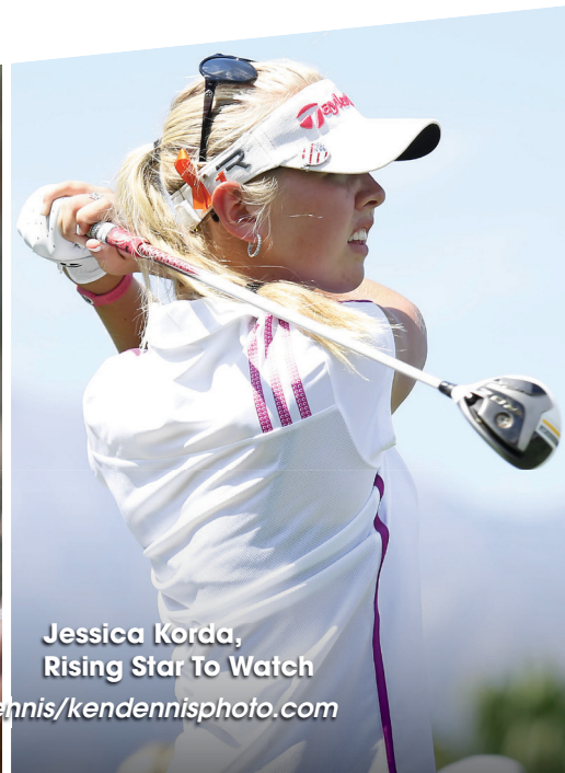
Jessica Korda, Rising Star To Watch