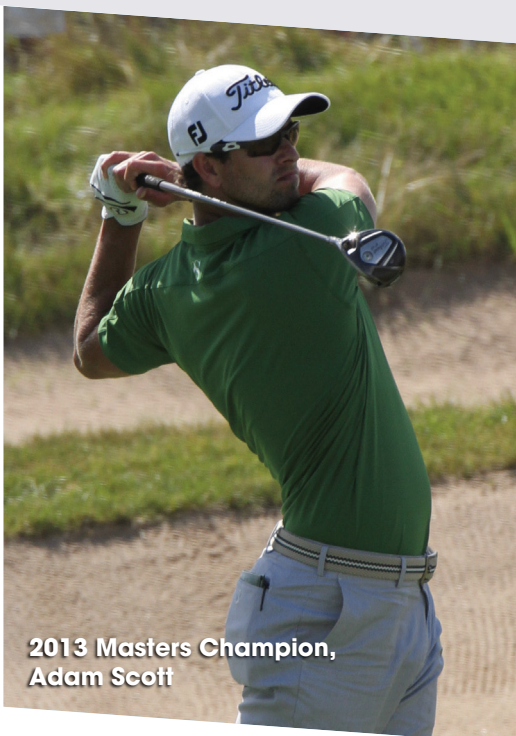
2013 Masters Champion, Adam Scott

Capturing his first Major Championship last April at The Masters, Adam Scott finally broke the Aussie curse that Greg Norman never could. After bogeying the final four holes in the 2012 Open Championship to lose to Ernie Els, many thought Scott didn't have what it took to win a major, but only two majors later he put those worries to bed with his win at Augusta. A teen heart throb when he first joined the PGA Tour in 2000, Scott has amassed 10 tour wins including the 2013 FedEx Cup Barclay's, 2011 WGC-Bridgestone Invitational, and the 2004 Players Championship. Only 33 years old he has already checked off a number of qualifiers for a Hall of Fame career.