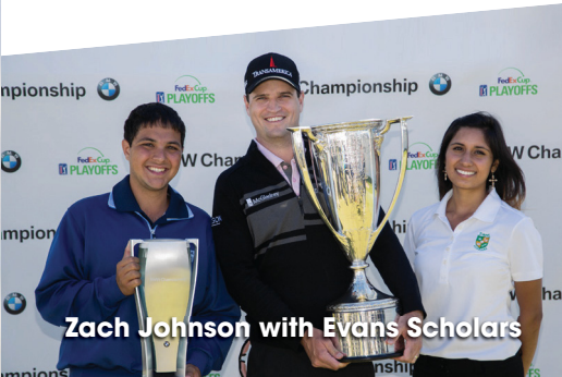
Zach Johnson with Evans Scholars