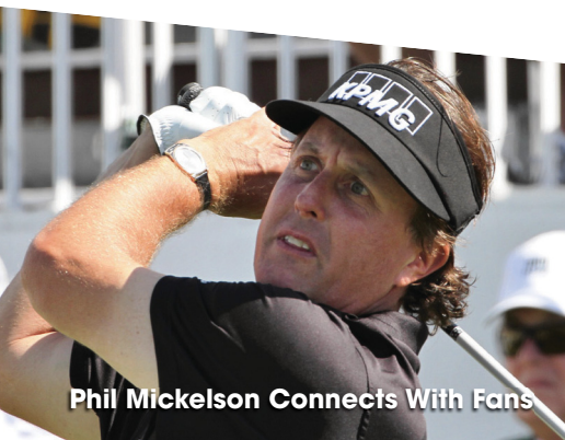
Phil Mickelson Connects With Fans

Checking off the third leg of the Career Grand Slam with his Open Championship victory at Muirfield in 2013, Phil Mickelson has consistently been one of the top ranked players in the world. With 42 PGA Tour wins, 5 Major Championships, Mickelson's go-for-broke playing style mirrors the fearless tenacity of Arnold Palmer. The only thing missing on Mickelson's resume is a U.S. Open victory, where he has finished second a record six times. Should he capture this elusive title, he would join the list of Tiger Woods, Jack Nicklaus, Gary Player, Ben Hogan, and Gene Sarazen as the sixth player to win the Career Grand Slam.